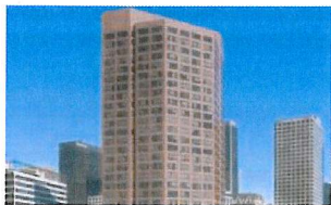
1055 S. Seventh St.

LACS is situated on 20 acres and features six 18,000-sf sound stages and one swing stage, as well as 450,000 sf of short- and long-term class A office space for entertainment-related and creative companies.